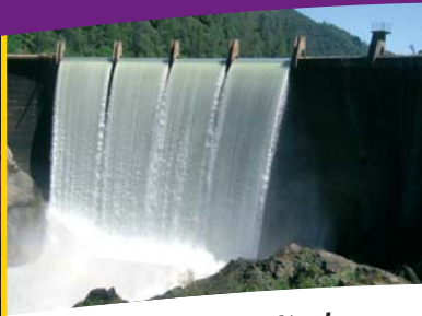
Dam wall monitoring